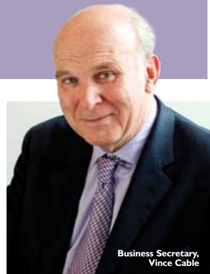
Business Secretary, Vince Cable

Business Secretary Vince Cable said, "Securing a return to long-term economic growth is the Government's highest priority. Helping entrepreneurs export to new markets and get access to the finance they need are critical to making this a reality. The SMEs of today are Britain's international success stories of the future and it is this success that will build the strong, balanced economy that will secure our economic prosperity."